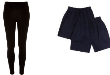
Shorts / leggings