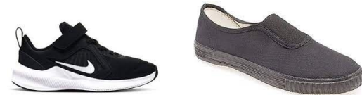
Trainers or plimsolls