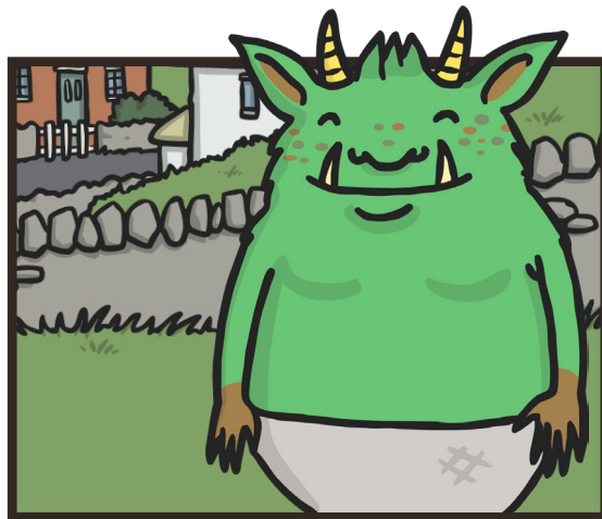
Tricky the Troll