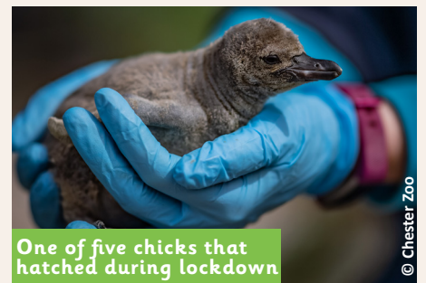
One of five chicks that hatched during lockdown.

THE supermarket chain Iceland has adopted every penguin at Chester Zoo! The company offered to help following an appeal by the zoo, which was at risk of closing down because of the coronavirus. Without any paying visitors, the zoo was racking up huge debts . It needs £1.5 million just to survive each month. Thankfully, the Government has now allowed zoos to reopen to small numbers of visitors.