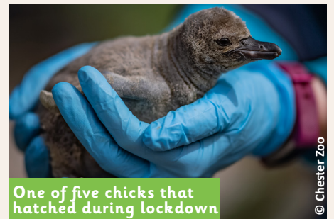
One of five chicks that hatched during lockdown.

THE supermarket chain Iceland has adopted every penguin at Chester Zoo! The company offered to help following an appeal by the zoo, which was at risk of closing down because of the coronavirus. Without any paying visitors, the zoo was racking up huge debts. It needs £1.5 million just to survive each month. Thankfully, the Government has now allowed zoos to reopen to small numbers of visitors.